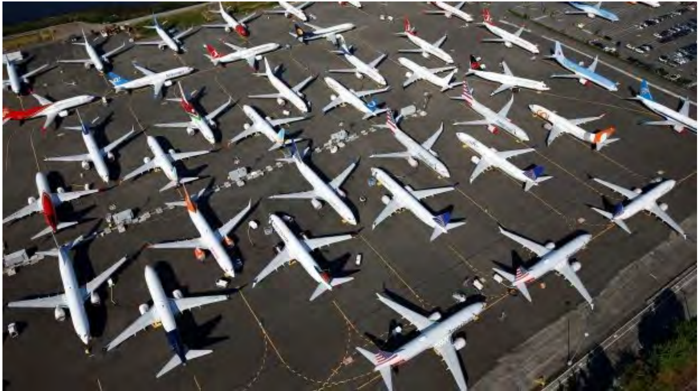
Dozens of grounded Boeing 737 MAX aircraft are seen parked in an aerial photo at Boeing Field in Seattle, Washington, U.S. July 1, 2019.

Go to Bluebills.org Heritage March Newsletter and click on the picture to read the article